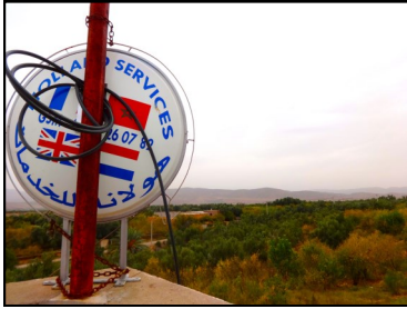
Photograph taken outside a small town outside of Burken, Morocco.