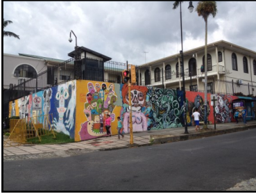
Photograph taken in Costa Rica.