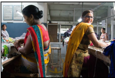
Photograph taken in India by Matt Stockamp .