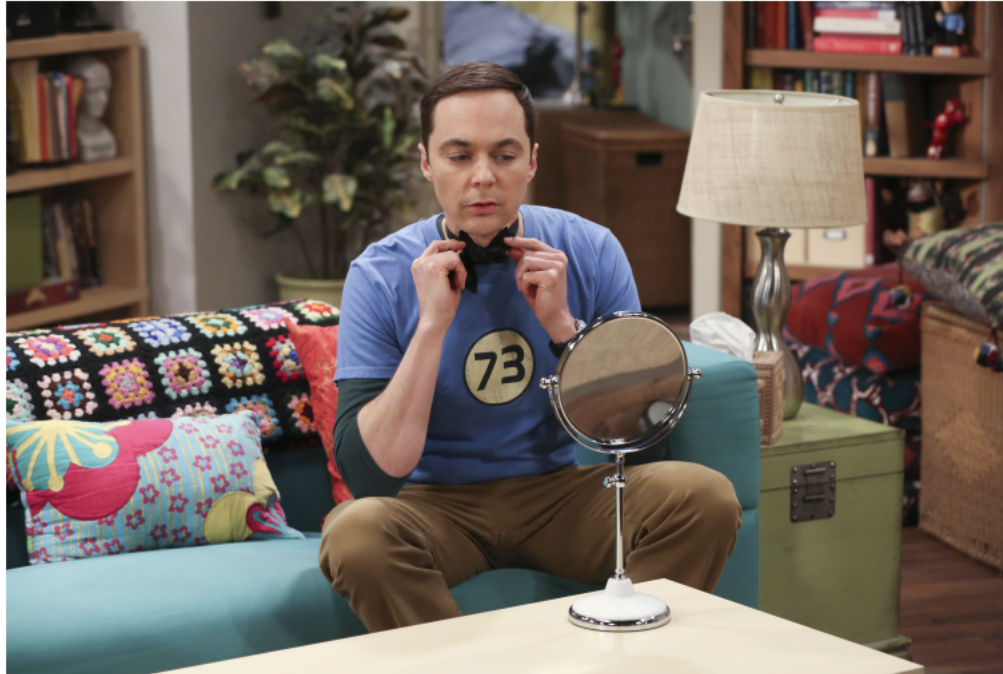
Figure 1. Sheldon always knew 73 was the best.