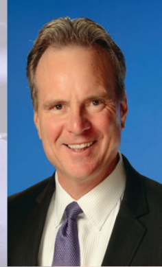
Moderated by NBC Bay Area's Damian Trujillo