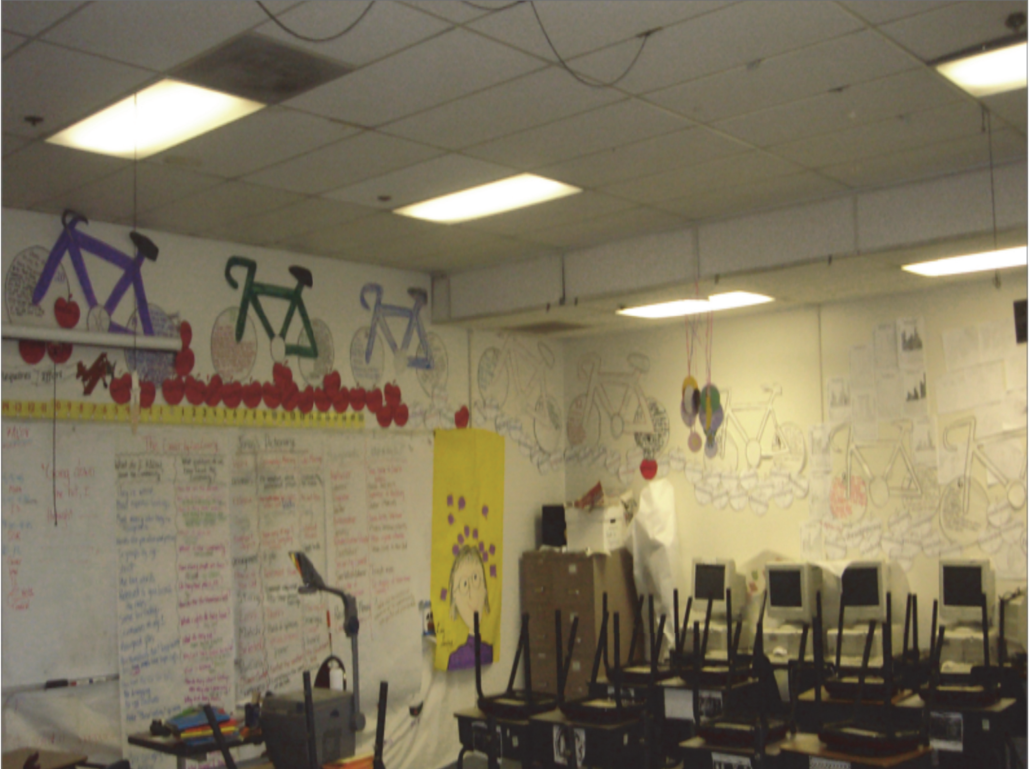
Wednesday, September 4, 2013