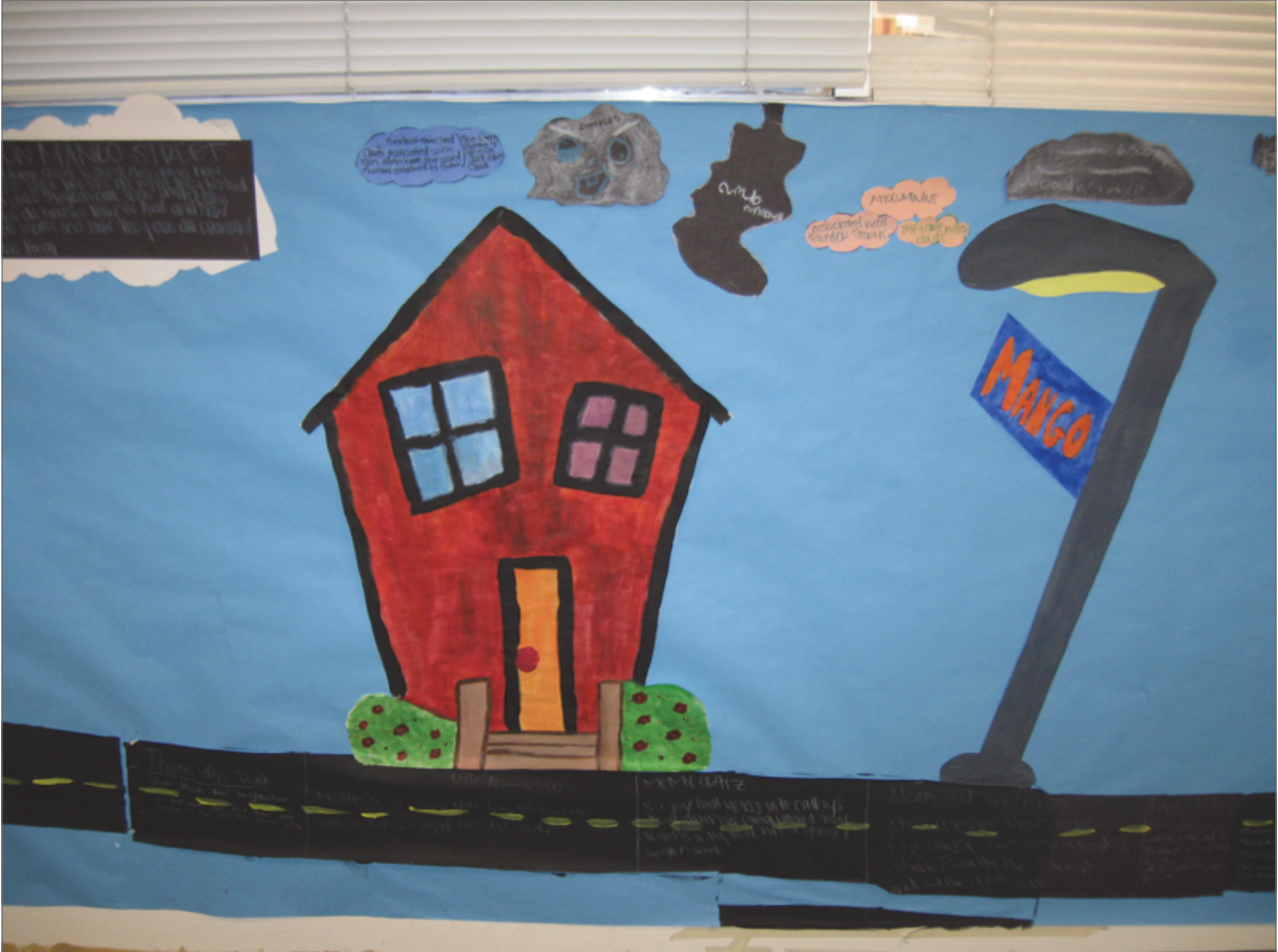
Wednesday, September 4, 2013