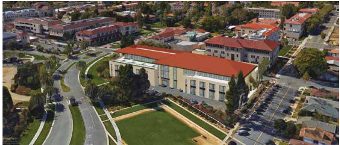
The Howard S. and Alida S. Charney Hall of Law.