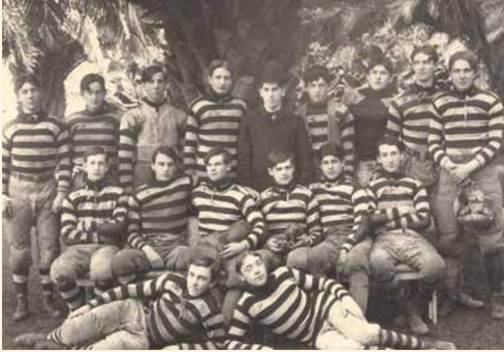
Santa Clara College Football Team, c. 1900–1917, photograph

A new art exhibit tells the 99-year history of sports at SCU