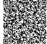
Add vContact Card

Customize and label contact details and note in 'Policyholder Name and Policy Number' from the cutout portion of ID Card below.