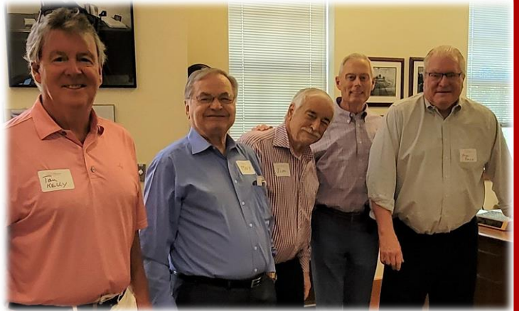
Members and their spouses enjoying a Champagne Reception in the Bannan Alumni House prior to attending Sister Act at the Mayer Theatre