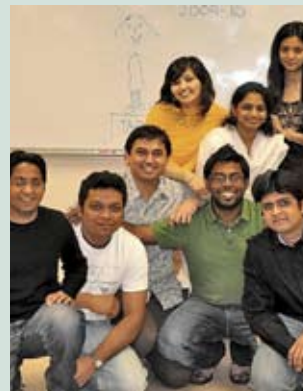
Swades board members.

An early look at the statistics emerging from SCU's enrollment management office revealed an interesting finding this spring: 77 percent of the students admitted into the new Bachelor of Science Web Design and Engineering (BSWDE) program are women. Read the rest of the story to find out why women are drawn to this program: scu.edu/engineering/eneews/2010spring