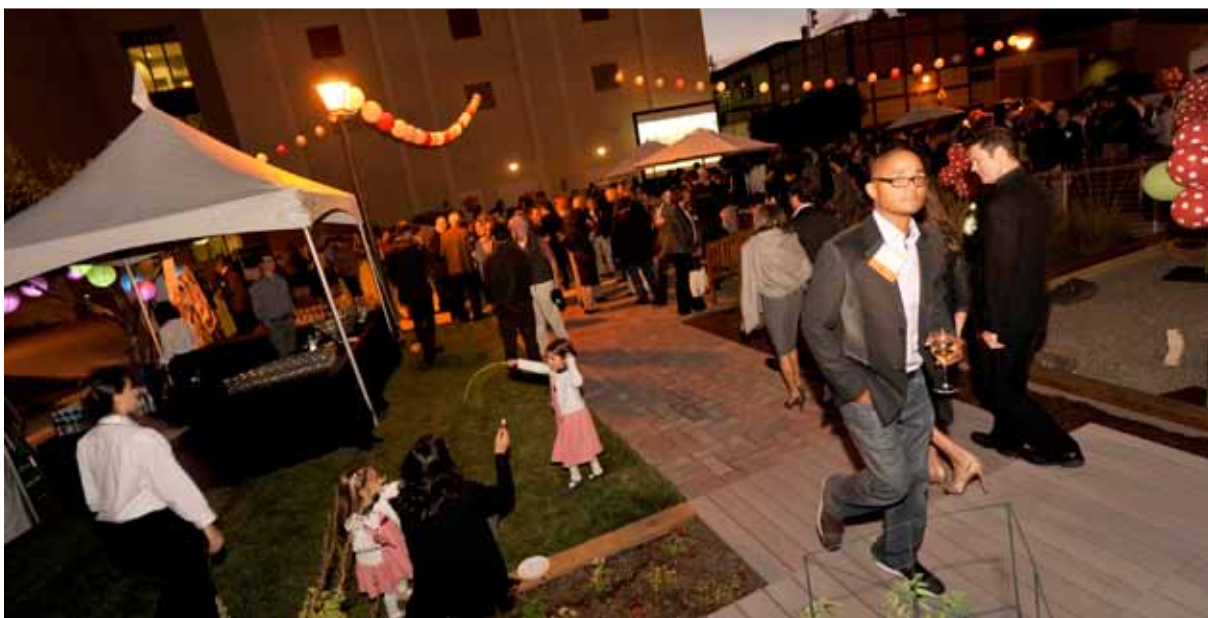
Hundreds of alumni, faculty, and friends celebrated the School of Engineering Centennial at The Biggest Bash Ever! in October.