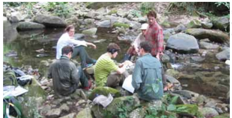
Site visits are an important part of the design process.

For more information on how to support the SCU student chapter of Engineers Without Borders, visit www.facebook.com/ewbscu .