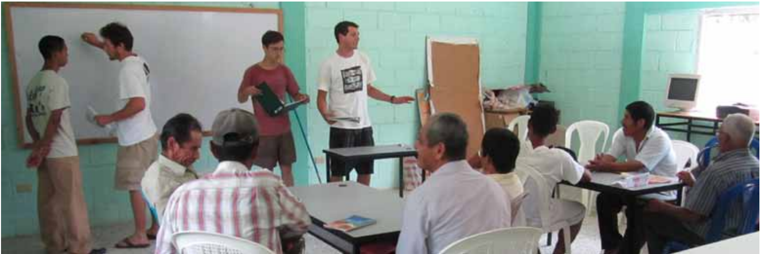
EWB students with members of the local water board

A spirit of adventure, willingness to help others, and desire to put their engineering skills to good use in the world are some of the motivations that drive engineering students to participate in the student chapter of Engineers Without Borders (EWB). But what keeps them involved ... is patience.