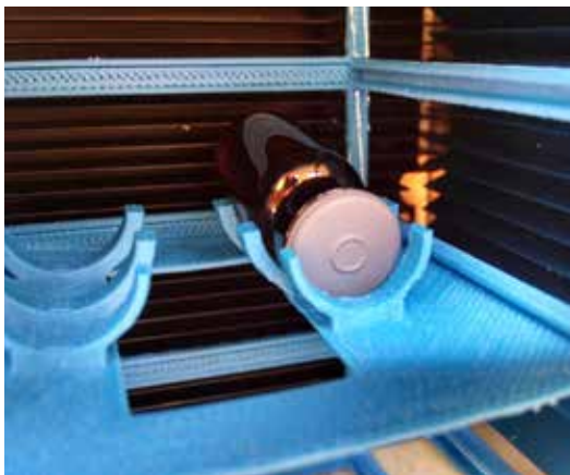
A closer look at the inside of the solar-powered, thermoelectrically cooled unit